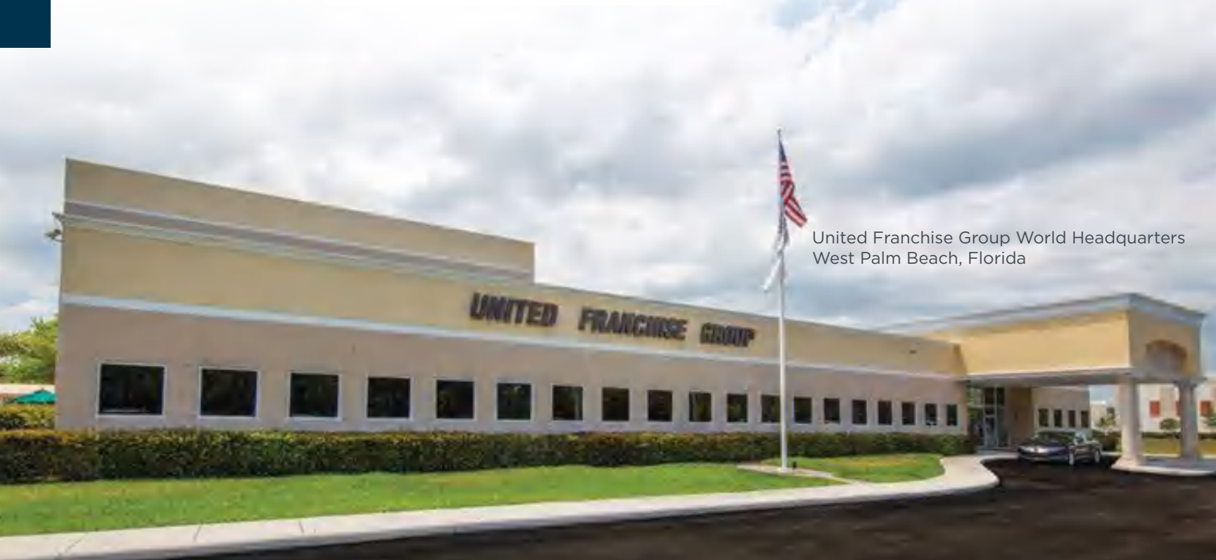
United Franchise Group World Headquarters West Palm Beach, Florida