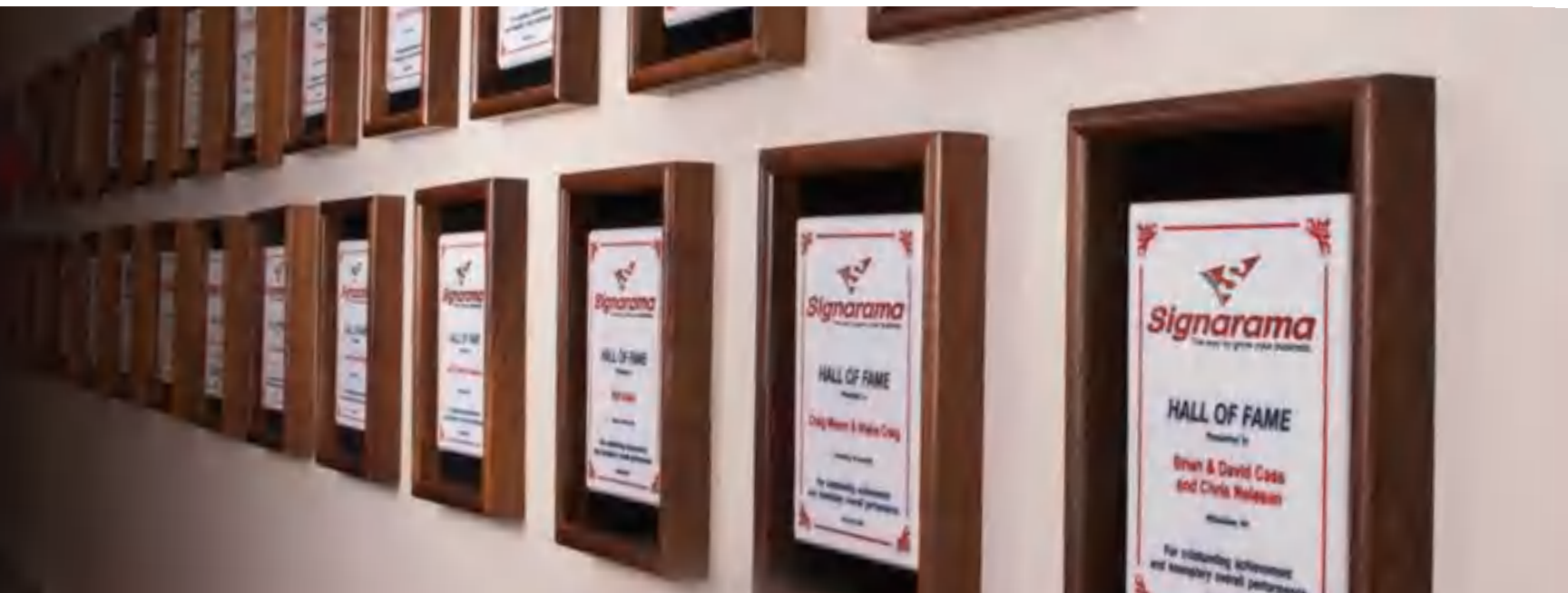
Global Headquarters "Hall of Fame"

We also mark each franchisee's success with a Star Awards program that recognizes regular sales milestones achieved in each location. Franchisees proudly display their awards in their store to share their accomplishment with the customers who helped to get them there.