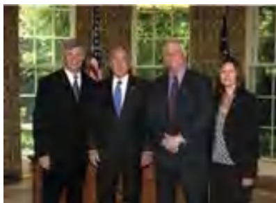
Receiving the award in the Oval Office

You can benefit from being part of a global family.