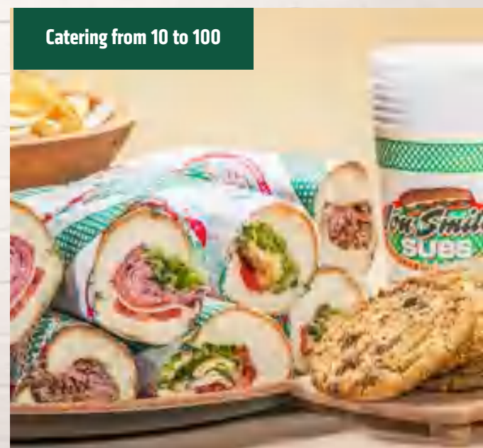
Catering from 10 to 100