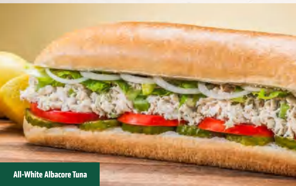
All-White Albacore Tuna