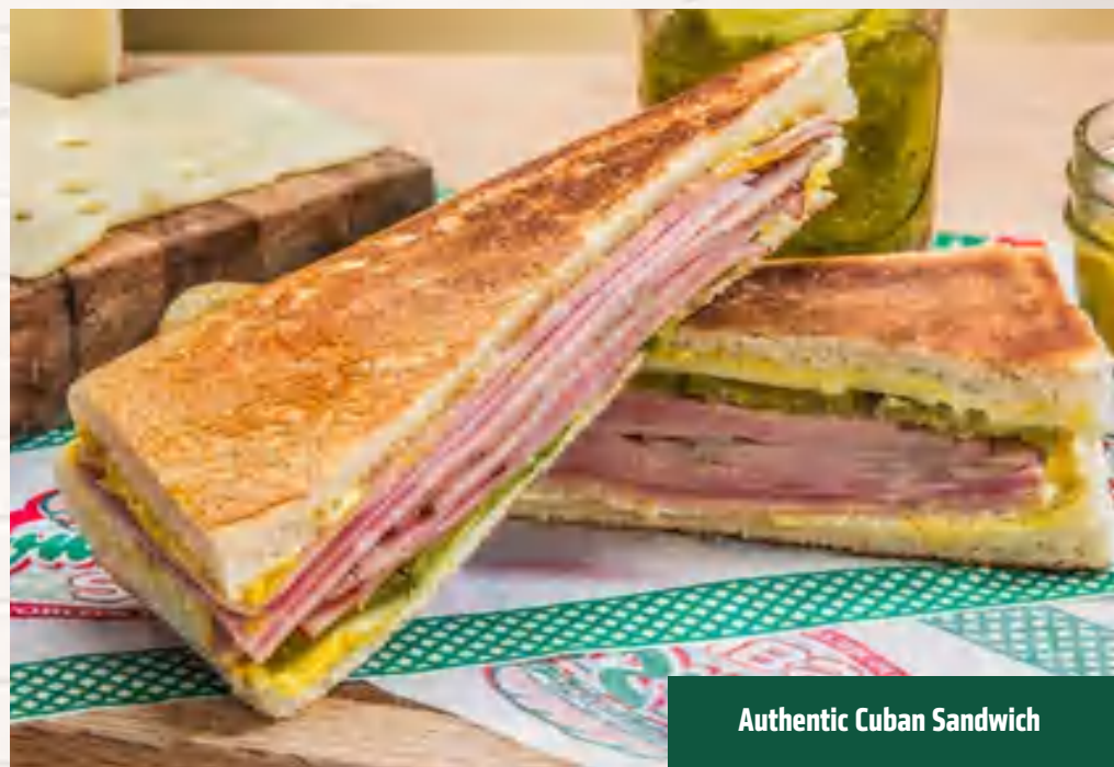
Authentic Cuban Sandwich