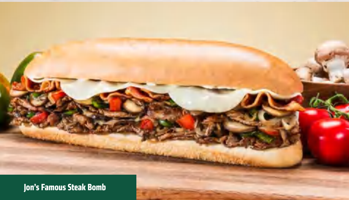
Jon's Famous Steak Bomb