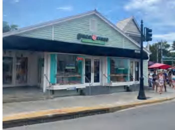
Our newest location in Key West, FL

Graze Craze is the newest brand to join the United Franchise Group (UFG) affiliated family of brands. UFG is a franchising powerhouse that manages numerous growing brands such as Signarama and Venture X. With 35+ years in the franchising industry, they have the knowledge and experience to streamline the process of opening new locations. They know how to bring newcomers into a business, show them the ropes, and set them on the right track towards growth.